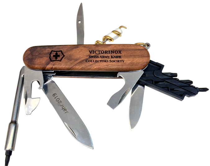
Below: The 2019 VSAKCS club knife, a Cybertool 29, celebrating 20 years. Limited availability.