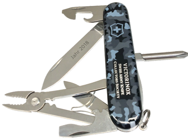
Above: The 2018 VSAKCS club knife, a 91mm Tinker, no longer available.